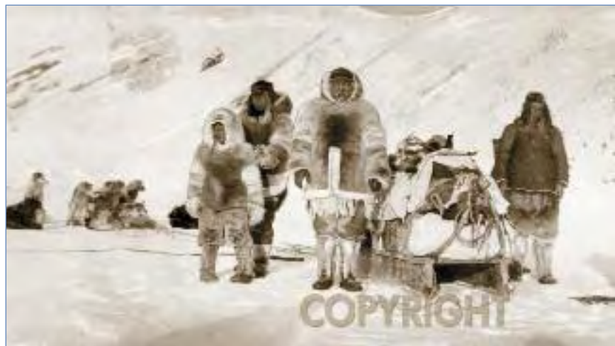
Inuit setting out on the spring hunt (photographed during a 1911 expedition by Captain Bernier)