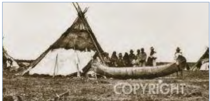
A group on Amerindians at Fort George, 1869. Note the curved shape of the Cree-built bark canoe.

From the standpoint of human rights and at a time when equal rights are being promoted, such measures appear to be rooted in another century. However, as mentioned previously, and as incredible as it may seem, this outdated enfranchisement provision was not abolished until 1985. In fact, the only choices