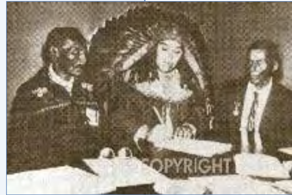
William Commanda (centre), Supreme Chief of the North American Indian Nation Government. This photograph appeared on the text of the government's proclamation.

Even though this judgement was quashed on appeal, the government brought the case before the Supreme Court, at which time Jules Sioui began a hunger strike that lasted 72 days. Finally, the government abandoned its proceedings (Tsiewei 1994, 17).