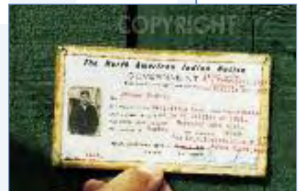
A North American Indian Nation Government registration card