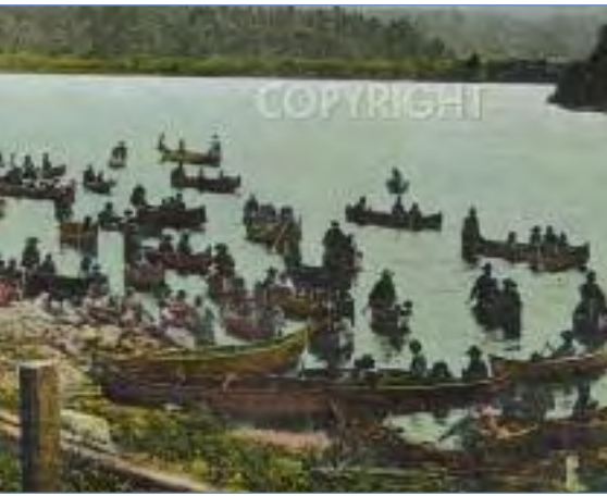
Some forty canoes gathered at Grand Lac Victoria, about 1930