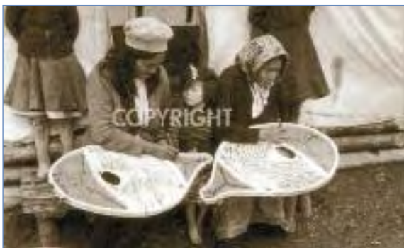
Crees making snowshoes at Grand Lac Mistassini, 1950

Section 109: "On the report of the Minister that an Indian has applied for enfranchisement and that in his opinion the Indian (a) is of the full age of twenty-one years, (b) is capable of assuming the duties and responsibilities of citizenship, and (c) when enfranchised, will be capable of supporting himself and his dependents, the Governor in Council may by order declare that the Indian and his wife and minor unmarried children are enfranchised."