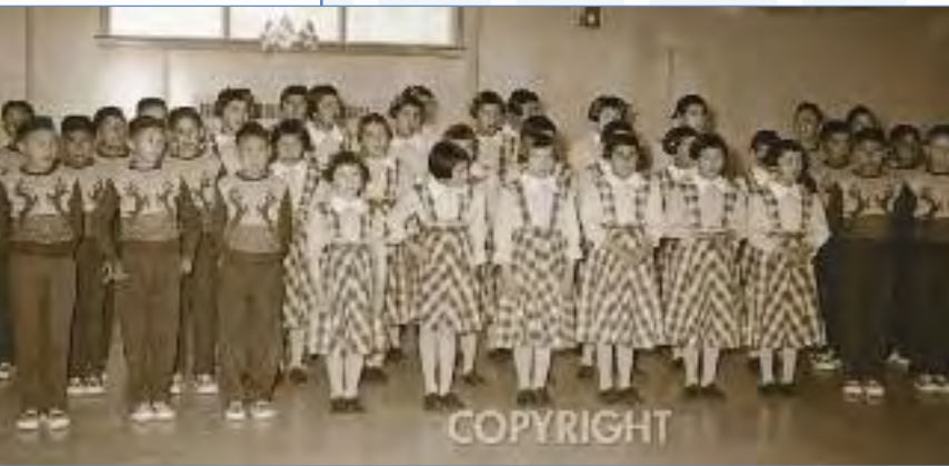
Amerindian students at the Saint-Marc-de-Figuery residential school, near Amos, in the 1950s