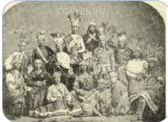
A group of Amerindians at a lacrosse tournament in 1869 (an engraving of a photograph by Inglis)

However, in reality, the Indian Act distorted this responsibility of protection by transforming the nations and tribes to be protected into minors under the guardianship of the federal government . In the name of protection, the government would decide what was in their best interests.