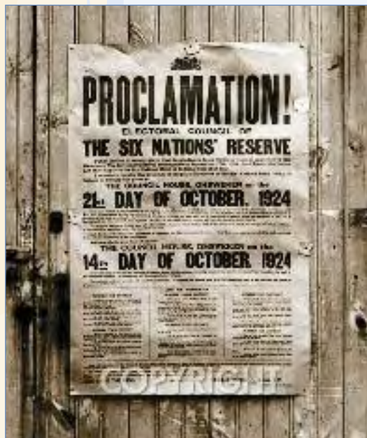
A poster announcing the elections on the Six Nations reserve in Ontario, October 1924